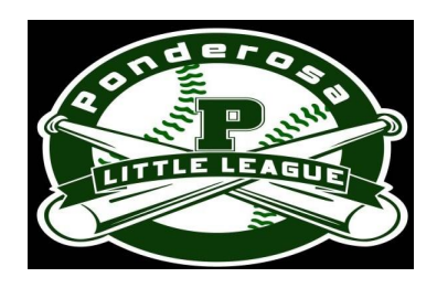
ARTICLE I. League Description